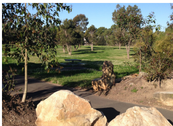
A great example of rehabilitation - Heron Park, Chipping Norton