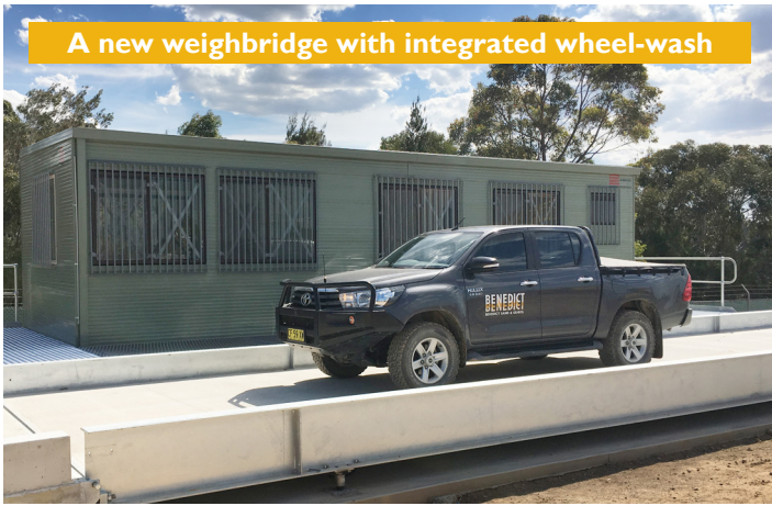
A new weighbridge with integrated wheel-wash