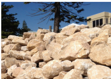
Caring for our environment - erosion control, Sandringham