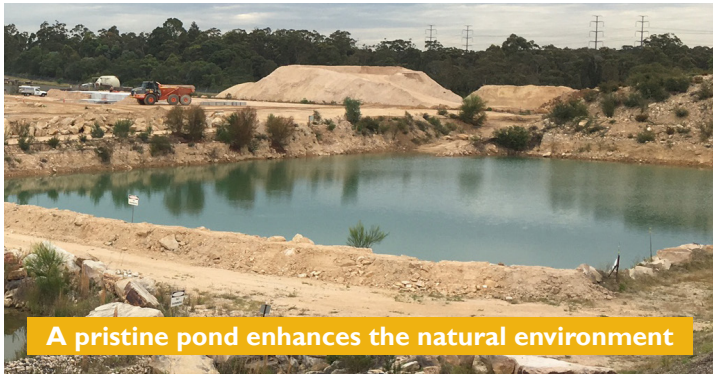
A pristine pond enhances the natural environment